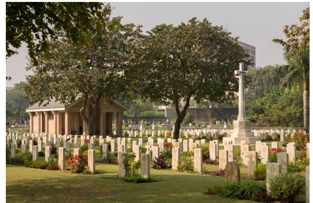
Bhowanipore Cemetery, Calcutta, India